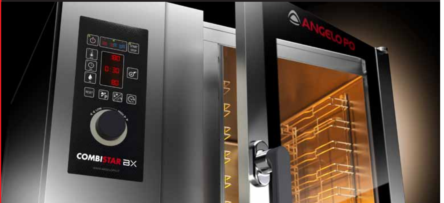
Multi Function Combi Oven